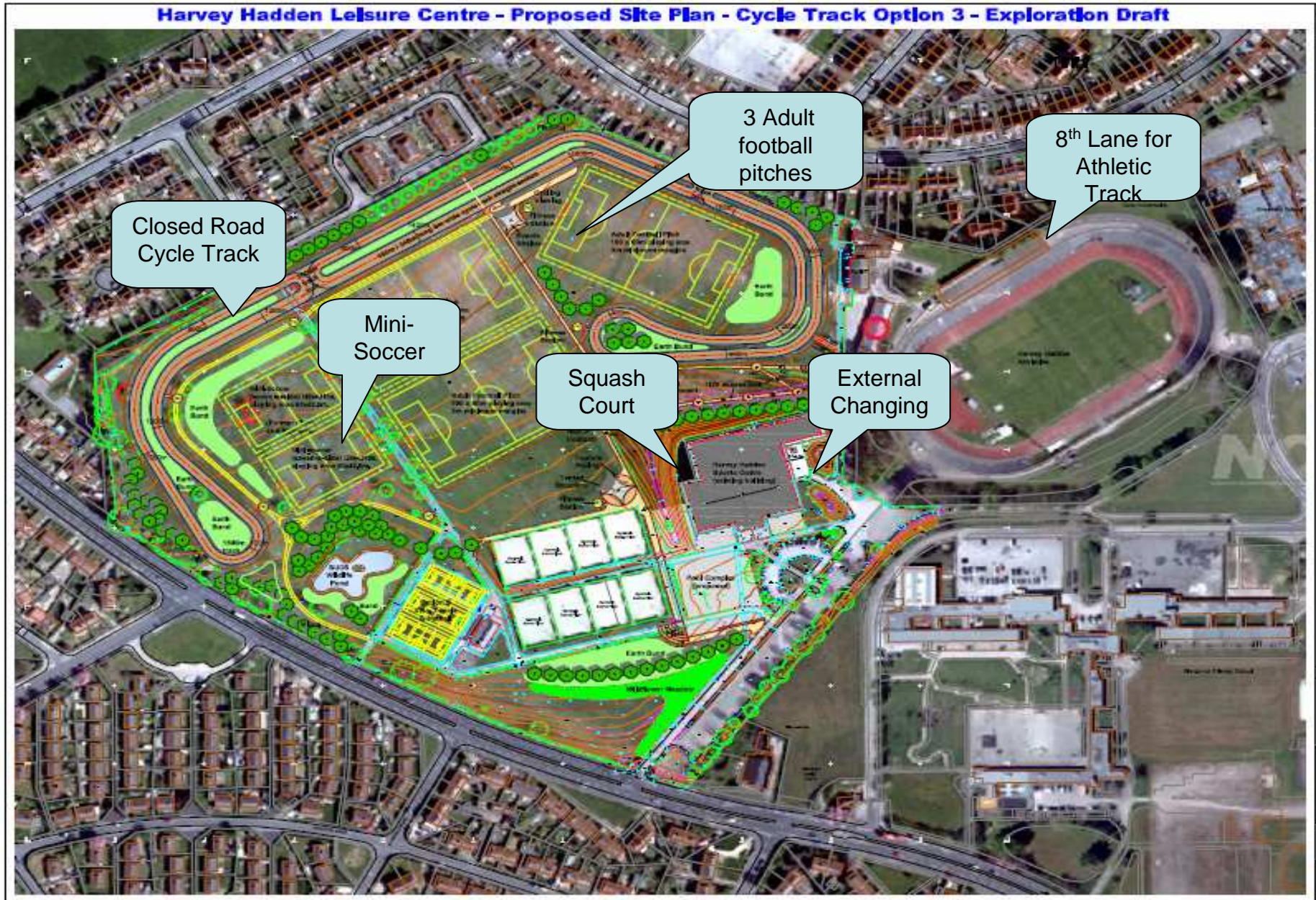
Harvey Hadden Leisure Centre - Proposed Site Plan - Cycle Track Option 3 - Exploration Draft